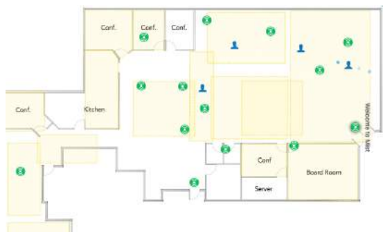
The AP21 works with the Mist cloud to provide high accuracy enterprise-grade Bluetooth® LE location services using virtual beacons

The AP21 has a 16-element Virtual Bluetooth® LE (vBLE) antenna array controlled from the Mist Cloud. Passive antennas enhance the power of a single transmitter and produce directional beams to accurately detect distance and location with 1 to 3 meter accuracy. With Mist's patented vBLE technology, you can deploy an unlimited amount of virtual beacons in your physical environment without requiring battery powered BLE beacons.