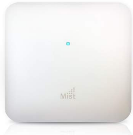
Mist AP21 Access Point