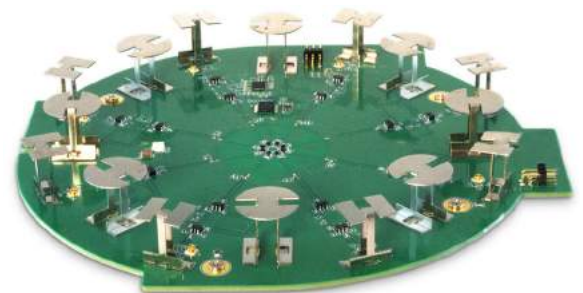
Mist Omni-Directional Bluetooth® Antenna Array