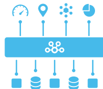
The Mist cloud, featuring a micro-services architecture, and powered by Marvis AI