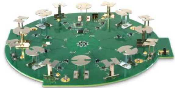
Mist Omni-Directional Bluetooth® Antenna Array