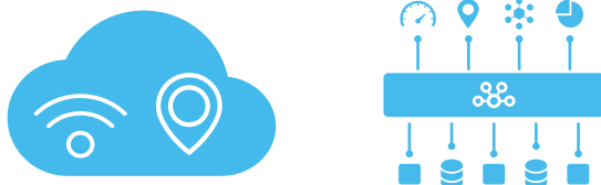
The Mist cloud, featuring a micro-services architecture, and powered by Marvis AI

The AP21, AP41, and AP61 are high performance, enterprise-grade Access Points for 802.11ac Wave 2 Gigabit Wi-Fi and Bluetooth® Low Energy. The Mist BT11 (detailed here), is an enterprise-grade Access Point exclusively for Bluetooth® Low Energy. To view other datasheets, go to www.mist.com/resources/datasheets/